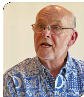
Torrance Mayor Pat Furey

respectively. Also, annual vehicle registration fees are increased in the range of $25 to $175, depending on vehicle market value.